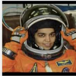
Miss. Kalpana Chawla