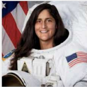
Mrs. Sunita Williams