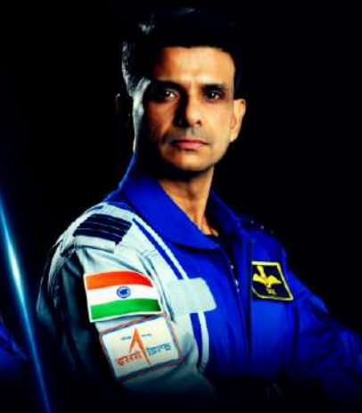
WING COMMANDER SHUBHANSHU SHUKLA