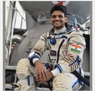
Mr. Shubhanshu Shukla